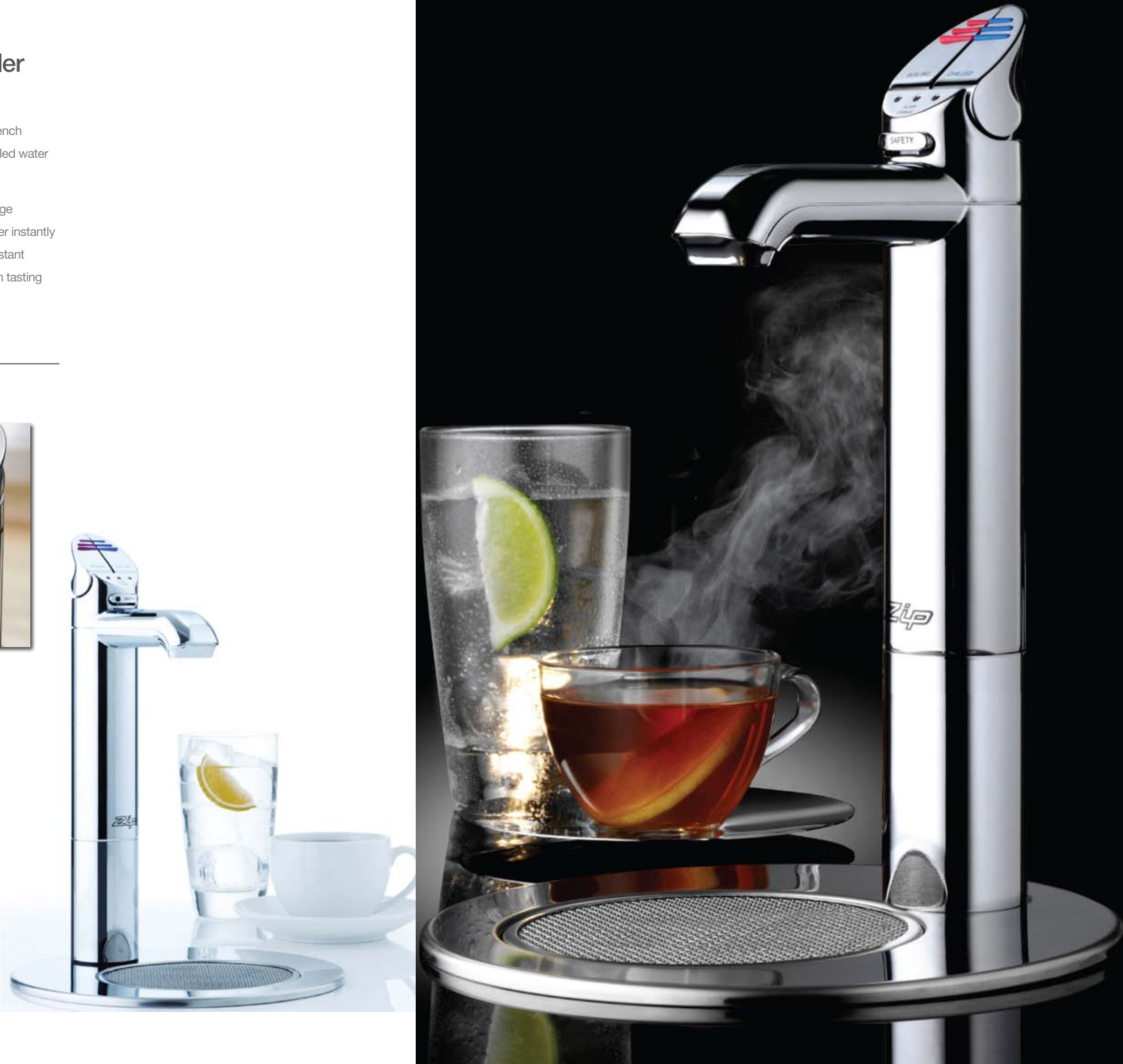
Image: Quench HydroTap. Quench branding may vary. (Image not shown to scale).