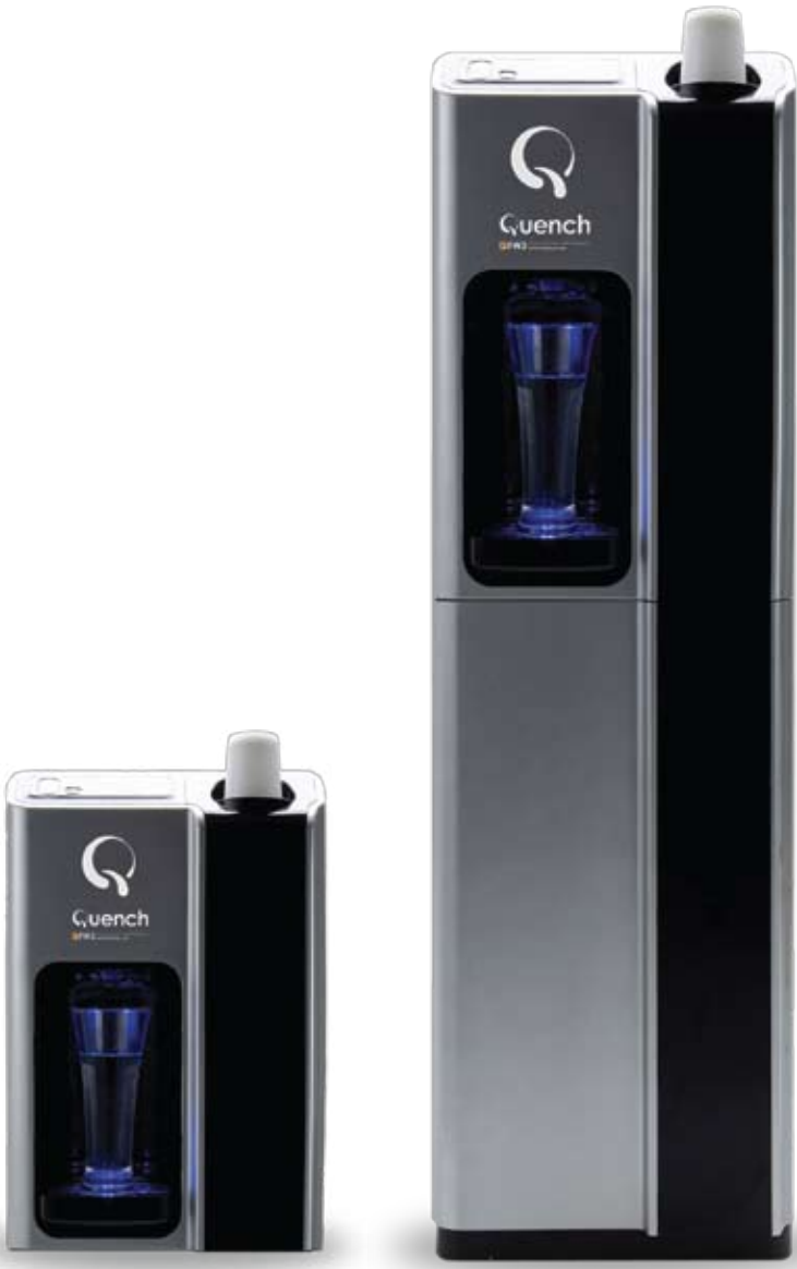
Images: Silver Elite counter-top and freestanding water coolers. Quench branding may vary. (Not shown to scale).

Unit dimension: H 1060 x W 325mm Projection: 365mm Capacity: 18 chilled litre/hour Finish: Silver / Graphite