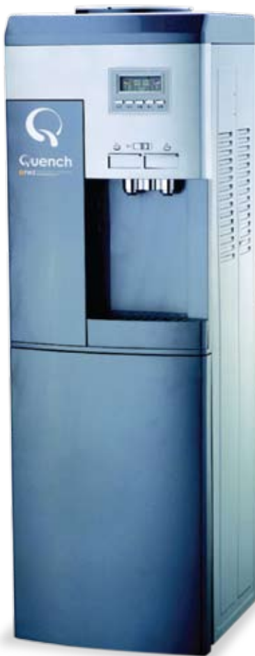
Left image: Silver and metallic blue Hydro freestanding water cooler. Quench branding may vary. (Image not shown to scale).

Unit dimension: H 990 x W 350mm Projection: 325mm Capacity: 2 chilled litre/hour; 5 hot litre/hour Finish: Silver and metallic blue