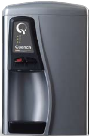
Images: Silver and graphite Classic counter-top and freestanding water coolers. Quench branding may vary. (Images not shown to scale).