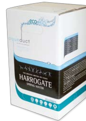
Image: Quench 10l boxed water. Quench branding may vary. (Image not shown to scale).

Unit dimension: 10L Box 200mm (W), 200mm (D), 320mm (H).