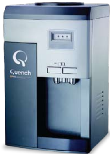
Image: Silver and metallic blue Hydro counter-top water cooler. Quench branding may vary. (Image not shown to scale).

Unit dimension: H 540x W 350mm Projection: 325mm Capacity: 2 chilled litre/hour; 5 hot litre/hour Finish: Silver and metallic blue