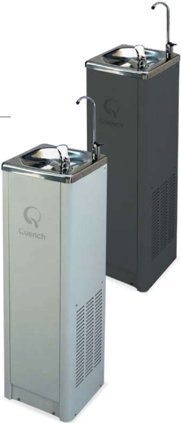
Images: Stainless steel slimline water coolers. Quench branding may vary. (Image not shown to scale).