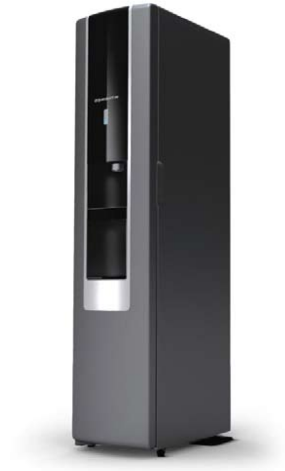
Top image: Quench bag-in-box PRO. Quench branding may vary. (Image not shown to scale).