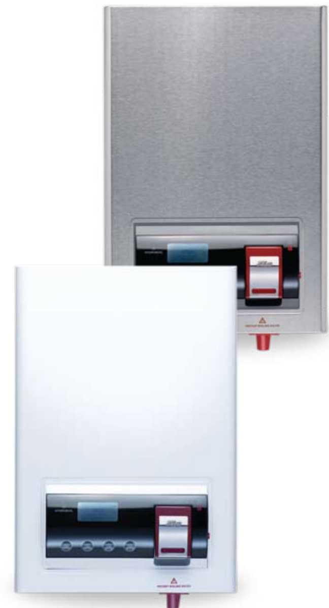
Images: Quench Hydroboil Plus white and stainless steel water boilers. Quench branding may vary. (Image not shown to scale).

Alternately the 'low light sleep mode' is available. An integral light detector automatically activates sleep mode (as above) when the room lights are switched off, returning to normal operation when the next draw off occurs or the lighting is switched back on.